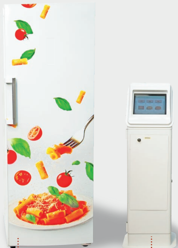
Frozen / Chilled Unit

Configurable with refrigerated or frozen dispensers.